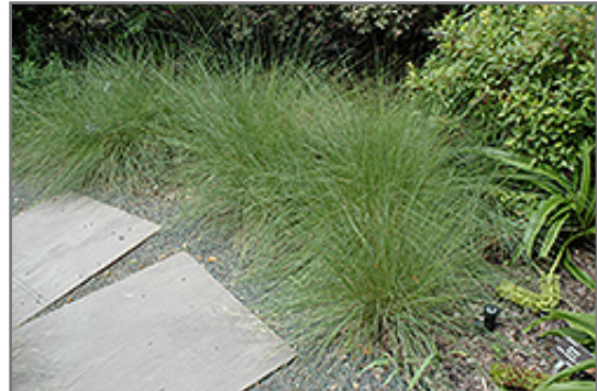
Hairawn Muhly

Hairawn Muhly is recommended for the following landscape applications;