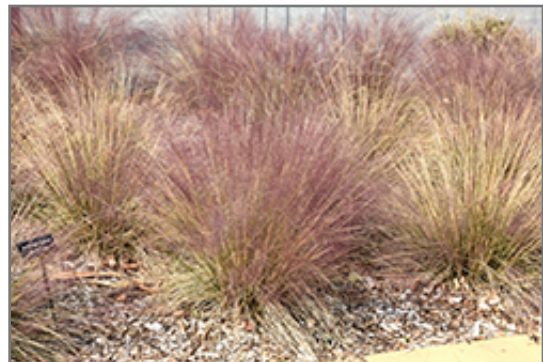
Hairawn Muhly in fall