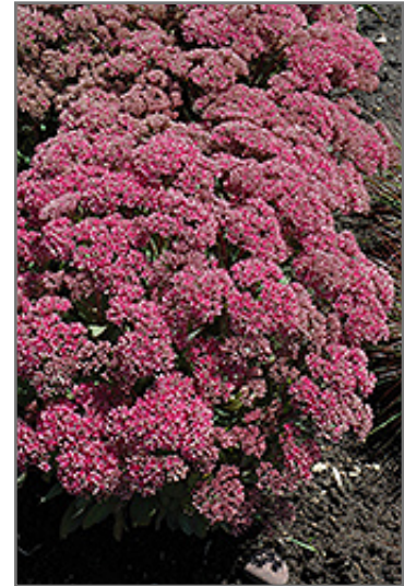
Mr. Goodbud Stonecrop flowers

Mr. Goodbud Stonecrop is recommended for the following landscape applications;