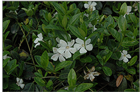
White Periwinkle flowers