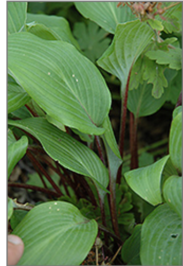
Red October Hosta foliage