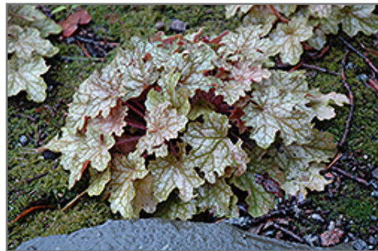
Ginger Ale Coral Bells