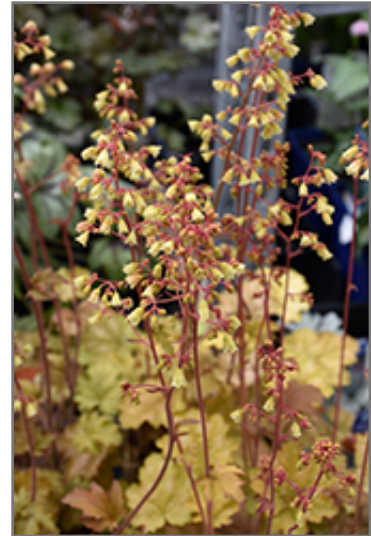
Ginger Ale Coral Bells foliage

Ginger Ale Coral Bells is a fine choice for the garden, but it is also a good selection for planting in outdoor pots and containers. It is often used as a 'filler' in the 'spiller-thriller-filler' container combination, providing a mass of flowers and foliage against which the larger thriller plants stand out. Note that when growing plants in outdoor containers and baskets, they may require more frequent waterings than they would in the yard or garden.