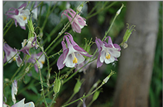
Common Columbine flowers