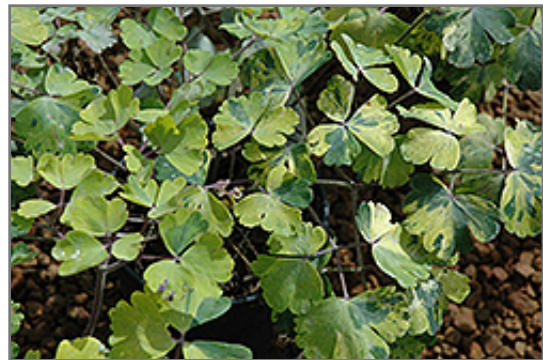
Leprechaun Gold Columbine foliage