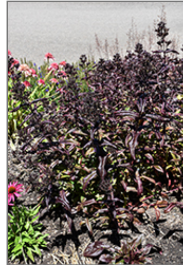
Dakota Burgundy Beard Tongue

Dakota Burgundy Beard Tongue is a fine choice for the garden, but it is also a good selection for planting in outdoor pots and containers. With its upright habit of growth, it is best suited for use as a 'thriller' in the 'spiller-thriller-filler' container combination; plant it near the center of the pot, surrounded by smaller plants and those that spill over the edges. Note that when growing plants in outdoor containers and baskets, they may require more frequent waterings than they would in the yard or garden.