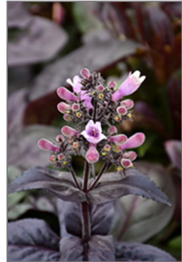
Dakota Burgundy Beard Tongue flowers

Dakota Burgundy Beard Tongue is an herbaceous perennial with an upright spreading habit of growth. Its medium texture blends into the garden, but can always be balanced by a couple of finer or coarser plants for an effective composition.