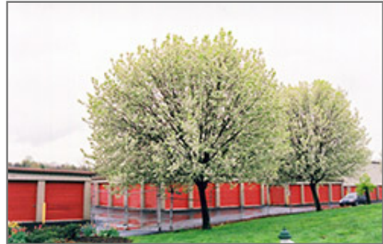
Bradford Ornamental Pear in bloom