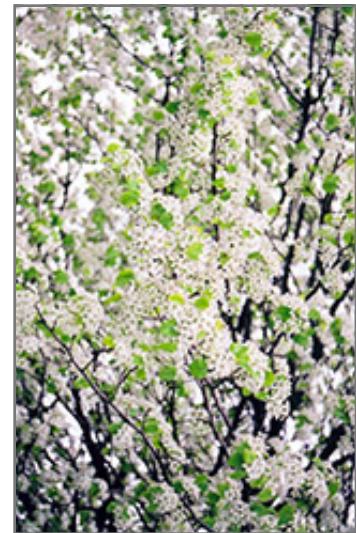
Bradford Ornamental Pear flowers