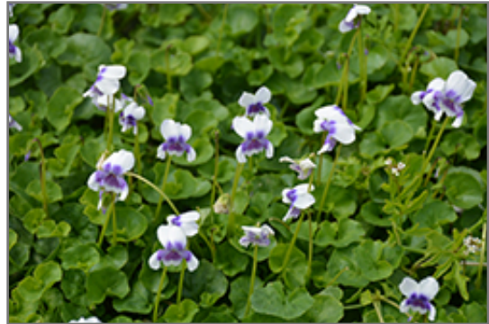
Australian Violet flowers

Australian Violet is recommended for the following landscape applications;