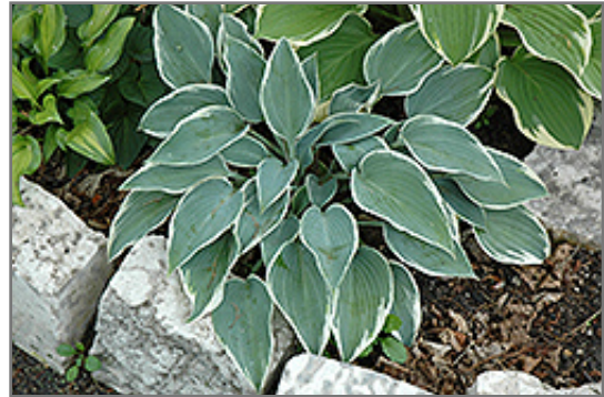
El Nino Hosta