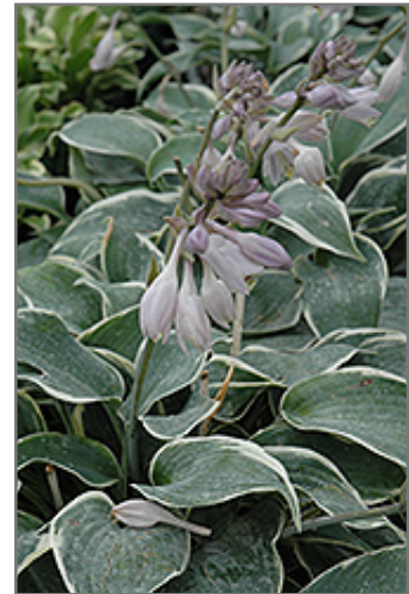
El Nino Hosta in bloom