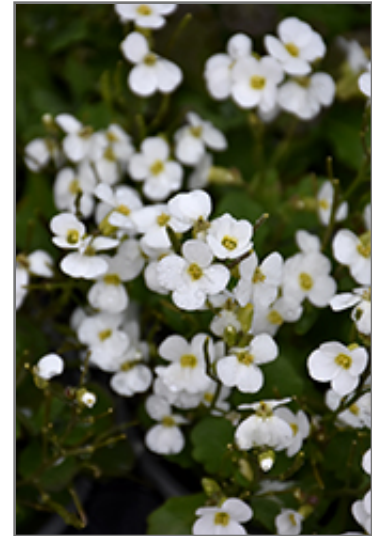
Catwalk White Wall Cress flowers

Catwalk White Wall Cress is recommended for the following landscape applications;