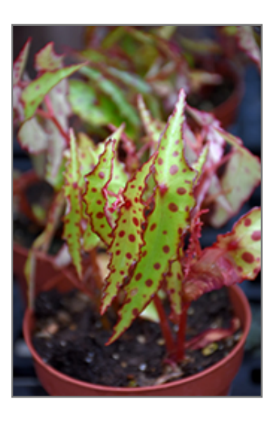
Butterfly Begonia foliage

This is an herbaceous evergreen houseplant with an upright spreading habit of growth. Its relatively fine texture sets it apart from other indoor plants with less refined foliage. This plant usually looks its best without pruning, although it will tolerate pruning.