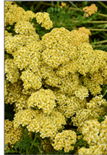
Milly Rock Yellow Terracotta Yarrow flowers