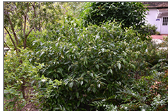
Little Psycho Wild Coffee flowers