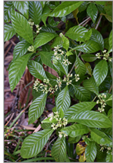
Florida Wild Coffee flowers

Florida Wild Coffee is recommended for the following landscape applications;