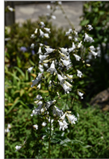
Foxglove Beardtongue flowers

Foxglove Beardtongue is recommended for the following landscape applications;