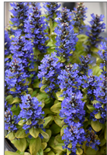
Feathered Friends Petite Parakeet Bugleweed flowers