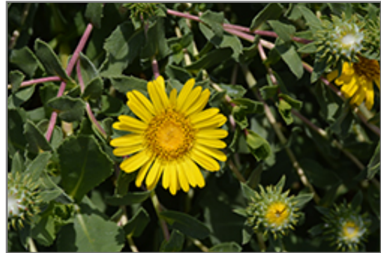
Ray's Carpet Coastal Gum Plant flowers

Ray's Carpet Coastal Gum Plant is recommended for the following landscape applications;