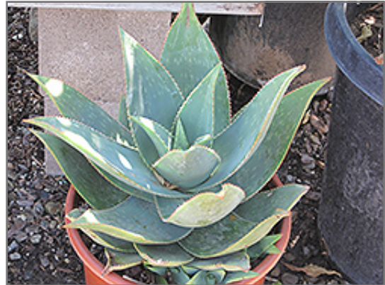
Ghost Aloe

Ghost Aloe is recommended for the following landscape applications;