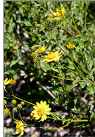
Cedros Island Crownbeard flowers

Cedros Island Crownbeard is recommended for the following landscape applications;