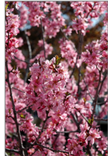
Muckle Plum (tree form) flowers