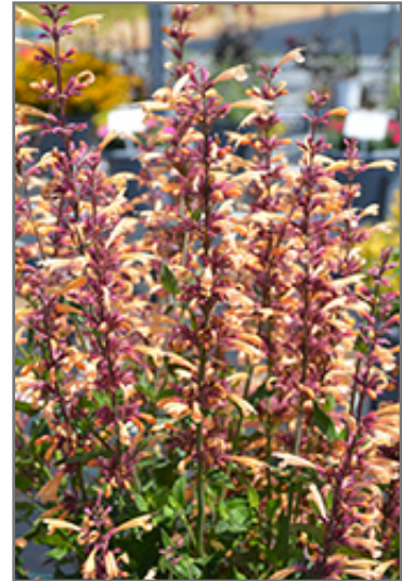
Meant To Bee Queen Nectarine Anise Hyssop flowers

Meant To Bee Queen Nectarine Anise Hyssop is recommended for the following landscape applications;