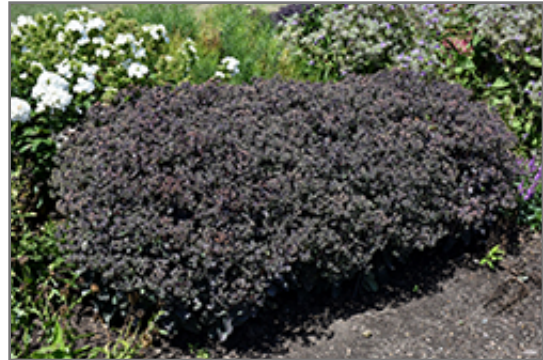
Night Light Stonecrop in bloom

This is a relatively low maintenance plant, and is best cleaned up in early spring before it resumes active growth for the season. It is a good choice for attracting butterflies to your yard, but is not particularly attractive to deer who tend to leave it alone in favor of tastier treats. It has no significant negative characteristics.