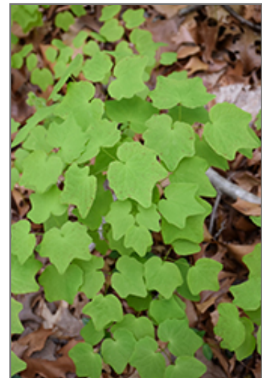
White Inside-Out Flower