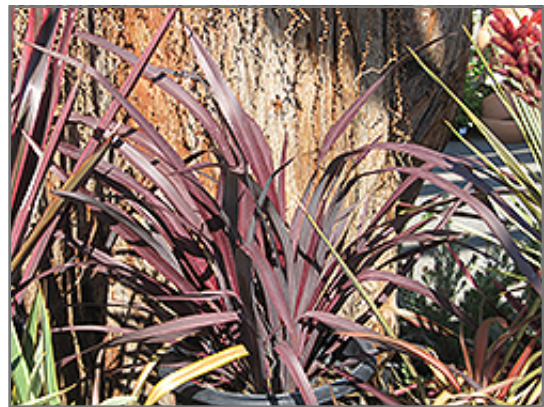
Dark Delight New Zealand Flax