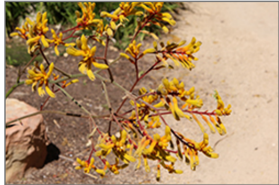
Yellow Gem Kangaroo Paw flowers

Yellow Gem Kangaroo Paw is recommended for the following landscape applications;