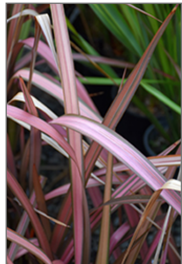
Pink Panther New Zealand Flax foliage