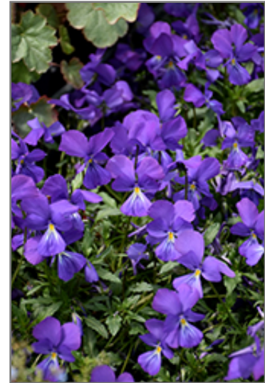
Corsican Pansy flowers