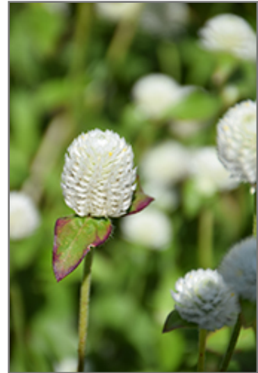
Las Vegas White Gomphrena flowers

Las Vegas White Gomphrena is recommended for the following landscape applications;