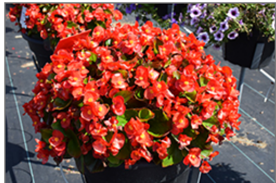
Super Cool Red Begonia in bloom