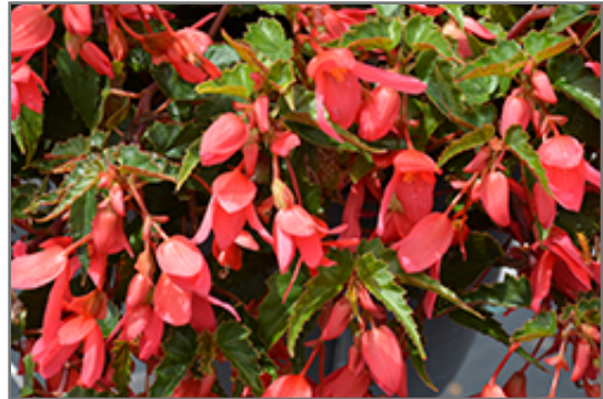
Groovy Rose Begonia flowers