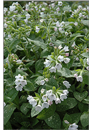
Sissinghurst White Lungwort flowers