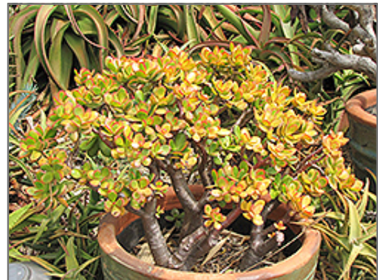
Sunset Jade Plant