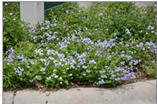
Creeping Jacob's Ladder in bloom