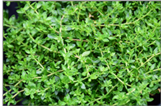
Rupturewort foliage

Rupturewort is recommended for the following landscape applications;