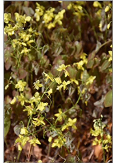
Colchian Barrenwort flowers