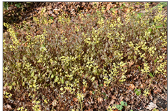
Colchian Barrenwort in bloom