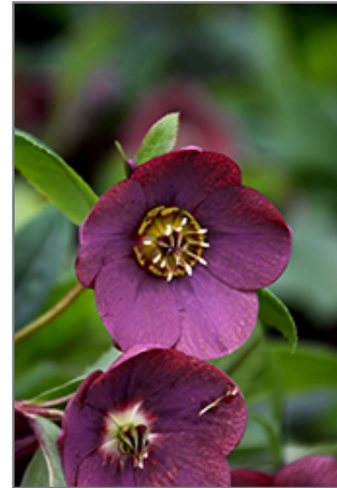
Honeymoon Rome In Red Hellebore flowers

Honeymoon Rome In Red Hellebore is recommended for the following landscape applications;