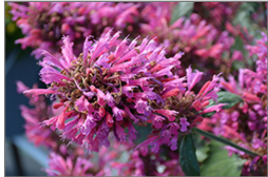
Morello Hyssop flowers

Morello Hyssop is a fine choice for the garden, but it is also a good selection for planting in outdoor pots and containers. With its upright habit of growth, it is best suited for use as a 'thriller' in the 'spiller-thriller-filler' container combination; plant it near the center of the pot, surrounded by smaller plants and those that spill over the edges. It is even sizeable enough that it can be grown alone in a suitable container. Note that when growing plants in outdoor containers and baskets, they may require more frequent waterings than they would in the yard or garden.