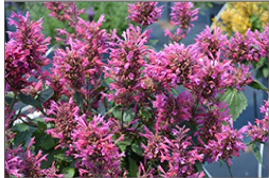
Morello Hyssop flowers

This is a relatively low maintenance plant, and is best cleaned up in early spring before it resumes active growth for the season. It is a good choice for attracting bees, butterflies and hummingbirds to your yard, but is not particularly attractive to deer who tend to leave it alone in favor of tastier treats. It has no significant negative characteristics.