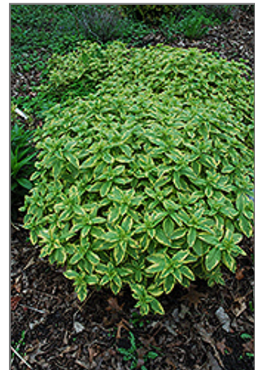
Golden Alexander Loosestrife