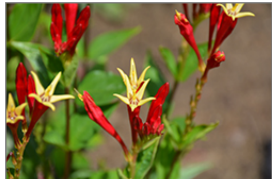
Little Redhead Indian Pink flowers