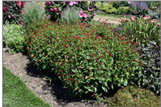
Little Redhead Indian Pink in bloom

Little Redhead Indian Pink is a fine choice for the garden, but it is also a good selection for planting in outdoor pots and containers. With its upright habit of growth, it is best suited for use as a 'thriller' in the 'spiller-thriller-filler' container combination; plant it near the center of the pot, surrounded by smaller plants and those that spill over the edges. Note that when growing plants in outdoor containers and baskets, they may require more frequent waterings than they would in the yard or garden.