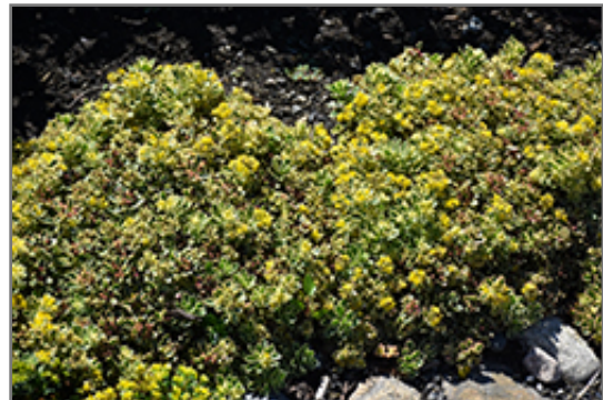
Rock 'N Low Boogie Woogie Stonecrop in bloom