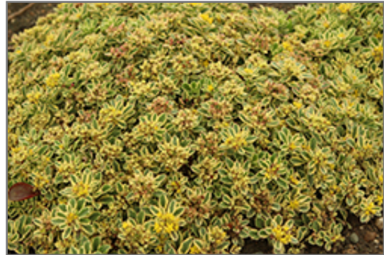
Rock 'N Low Boogie Woogie Stonecrop flowers

Rock 'N Low Boogie Woogie Stonecrop is a dense herbaceous perennial with a mounded form. Its medium texture blends into the garden, but can always be balanced by a couple of finer or coarser plants for an effective composition.