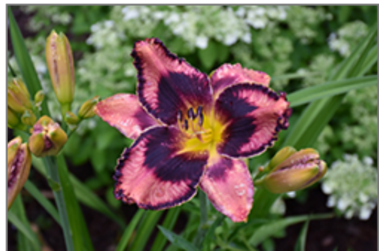
Rainbow Rhythm Storm Shelter Daylily flowers