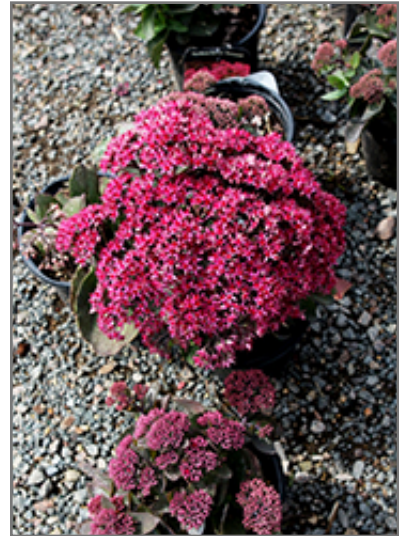
Dynomite Stonecrop in bloom

Dynomite Stonecrop is recommended for the following landscape applications;