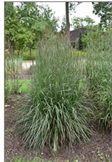
Blackhawks Bluestem in bloom