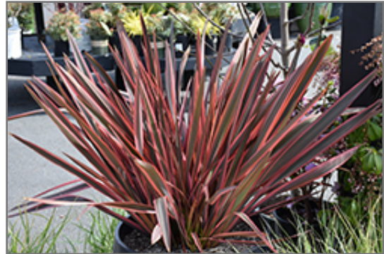
Rainbow Chief New Zealand Flax

This is a relatively low maintenance plant, and is best cleaned up in early spring before it resumes active growth for the season. Deer don't particularly care for this plant and will usually leave it alone in favor of tastier treats. It has no significant negative characteristics.