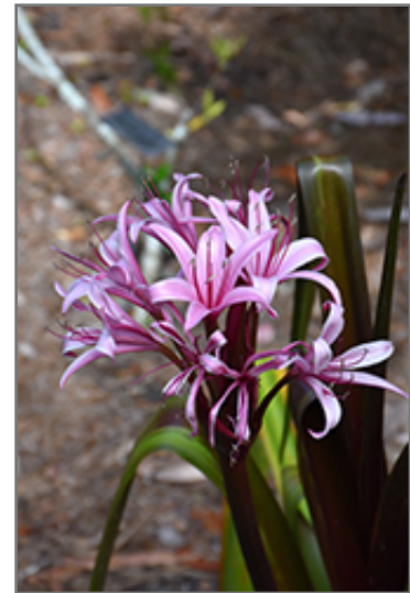
Sangria Crinum flowers