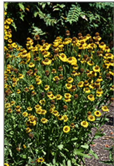
Salud Golden Sneezweed in bloom