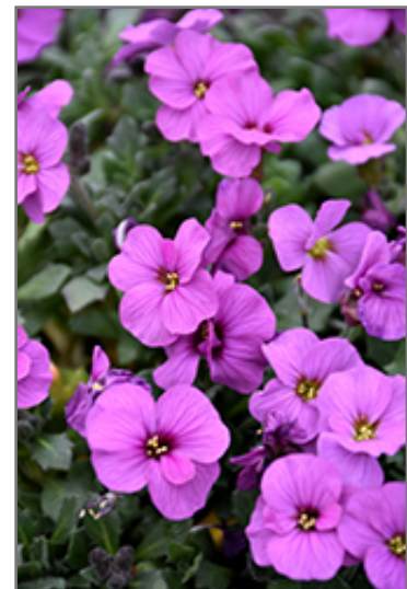
Axcent Antique Rose Rock Cress flowers