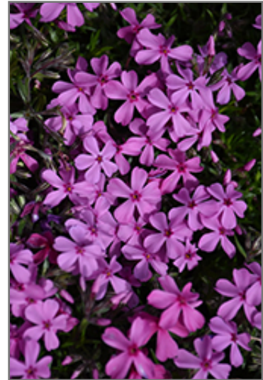
Spring Dark Pink Moss Phlox flowers